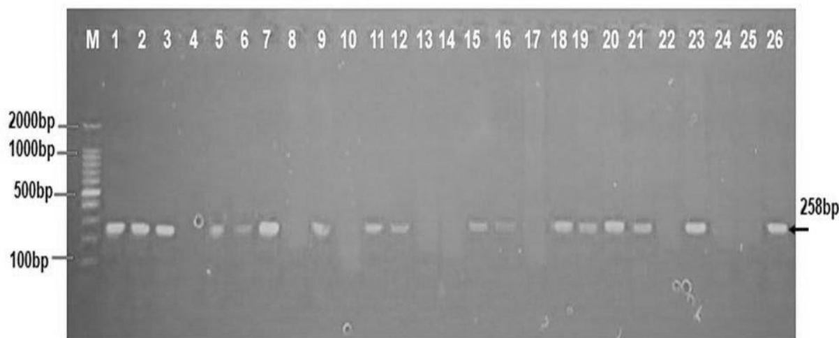
Figure 1 (Agarose gel electrophoresis image illustrating the PCR product of the iss gene at 258 bp in different bacterial isolates. M: DNA marker (2000-100 bp); lanes 1-5: Escherichia coli ; lanes 6-10: Klebsiella pneumoniae ; lanes 11-15: Salmonella typhi ; lanes 16-20: Shigella dysenteriae ; lanes 21-22: Serratia marcescens ; lanes 23-26: Proteus vulgaris .)