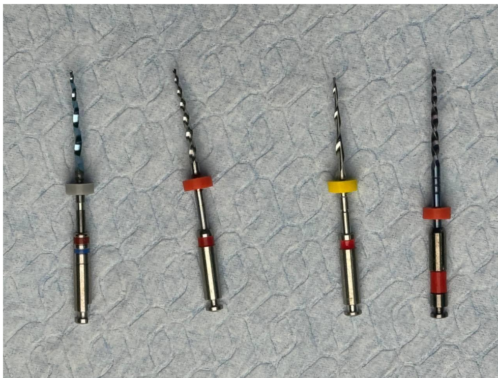
Figure 2: (A): Files used in experiment

design was based on previous models approached by Larsen et al. (2009), Al-Sudani et al. (2012), and Yılmaz et al. (2017) (22-24). The artificial canal was then covered by tempered glass (8×3 cm) to prevent the instrument from slipping out and to allow for observation of the instrument during operation and when fracture occurs; subsequently, the fracture was readily observed through the cover glass (25). The manufacturing process of the artificial canal in the stainless-steel block is shown in Figures 2–10. All the rotary instruments were evaluated by stereomicroscope to detect any deformation for exclusion.