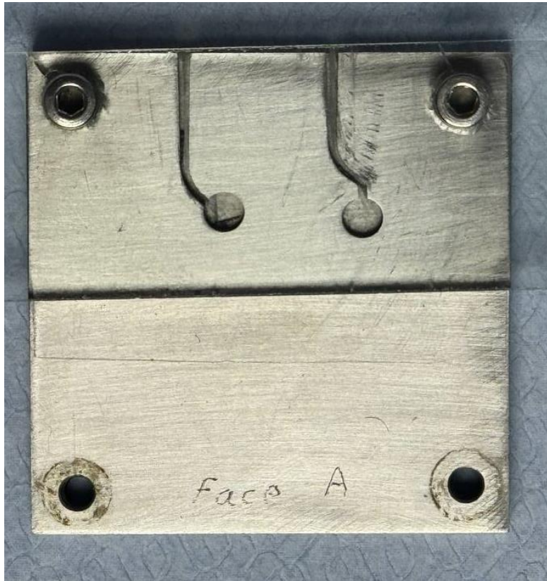
Figure 2: (B): Cyclic fatigue testing device