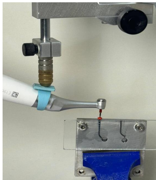
Figure 1: Method of artificial canal manufacture in the stainless-steel block

Cyclic fatigue testing was done by a specialized stainless-steel block that was custom-made with a single curvature canal (60° angle of curvature with 5 mm radius; the beginning of curvature was 5 mm distant from the end of the canal). The center of the curvature was located at 5.25 mm from the end of the canal and it represents the curve length (Figure 1). The total length of the artificial canal was 18 mm and the inner diameter of the canal was 1.5 mm.